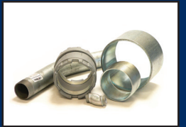
NIPPLES ELBOWS & COUPLINGS

Use our vast inventory as alternatives to sell when you're out of stock