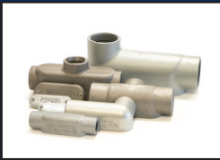
FITTINGS & COVERS