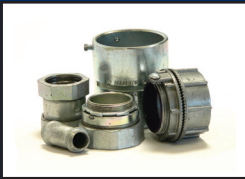
COMPRESSION COUPLINGS & CONNECTORS