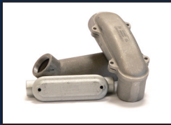
MOGUL & PULLING ELBOWS