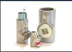
SEALS AND DRAINS